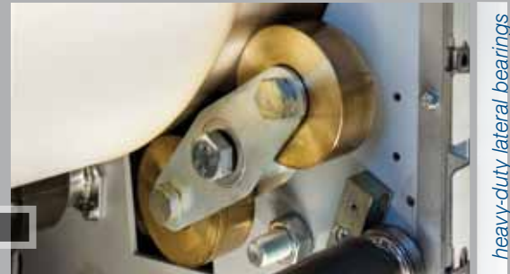
heavy-duty lateral bearings