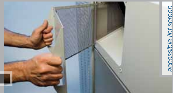
accessible lint screen