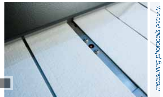
measuring photocells (x20 only)