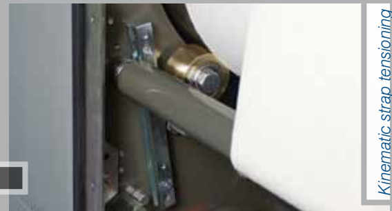
Kinematic strap tensioning