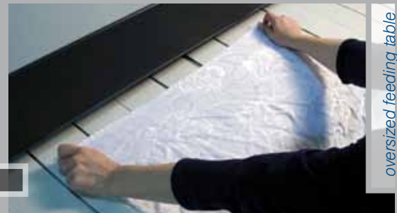
oversized feeding table