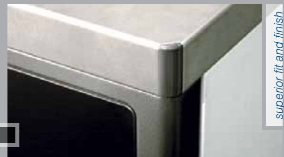
superior fit and finish