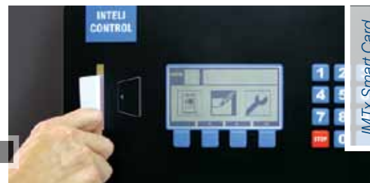
IMTx Smart Card